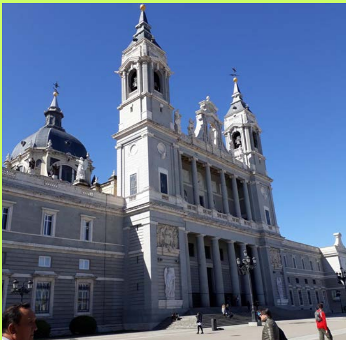
A church in central Madrid