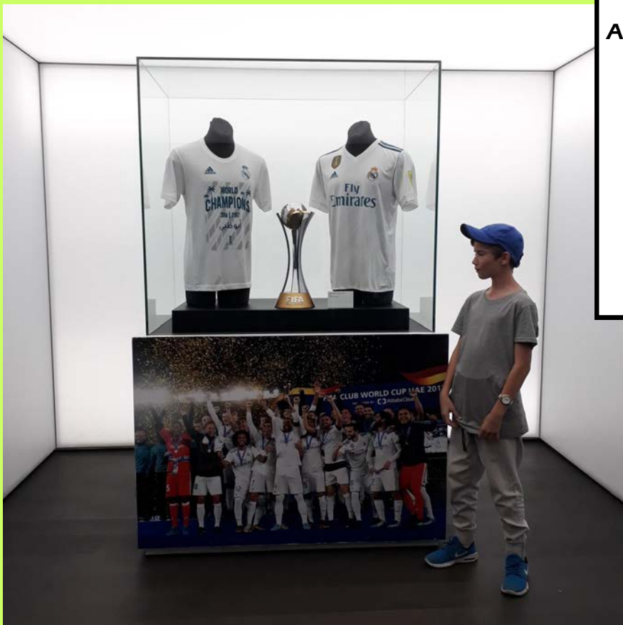
Here is me in front of some Real Madrid jerseys.