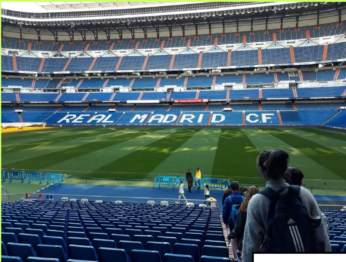
The Real Madrid Football Club stadium